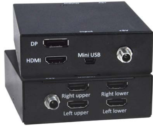
SPLITMUX-VWC-HDDPI-4HDO (Front & Back)