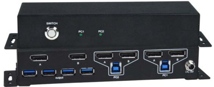
UNIMUX-DP4K-2DH (Front & Back)